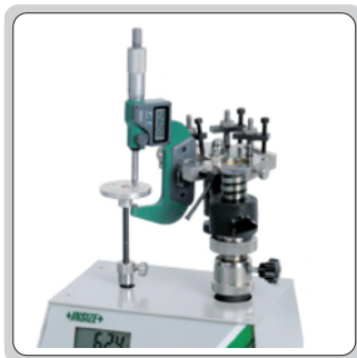
check the measuring force of micrometer