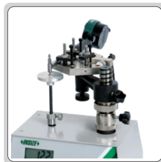
check the measuring force of bore gage