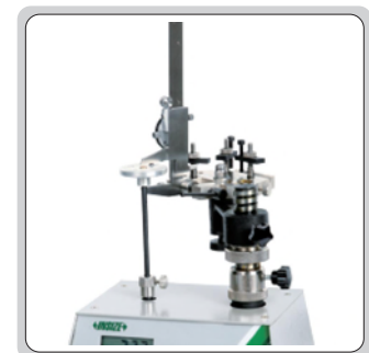
check the measuring force of caliper