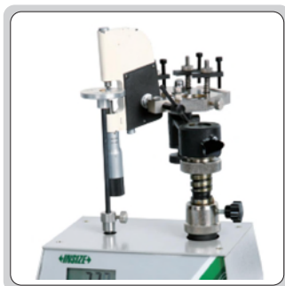
check the measuring force of indicating micrometer