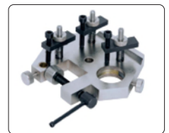
clamping disk (included)