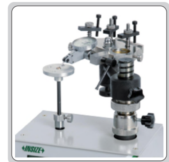
check the measuring force of dial test indicator