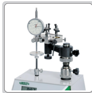
check the measuring force of dial indicator